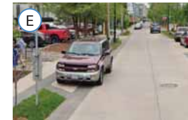
Curb extension with parking