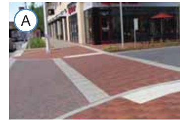
Unique paving opportunity