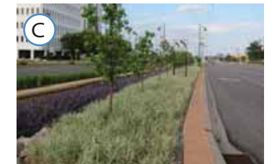
Rain garden + tree trench