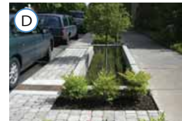
Planters + landscaping