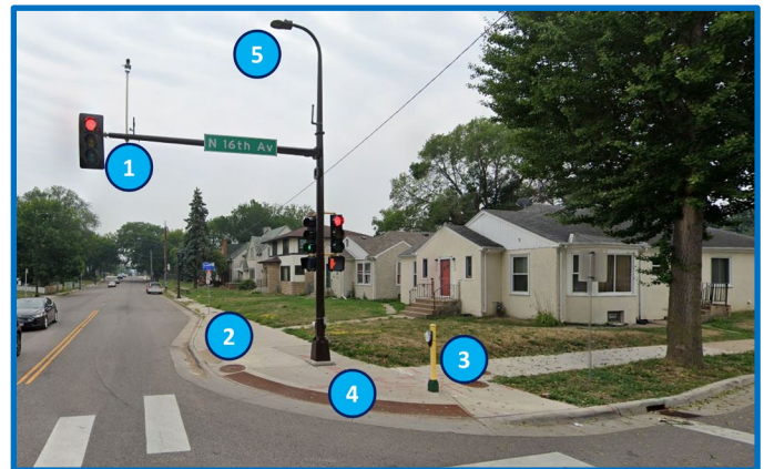
Example Illustration – Exact designs vary by location