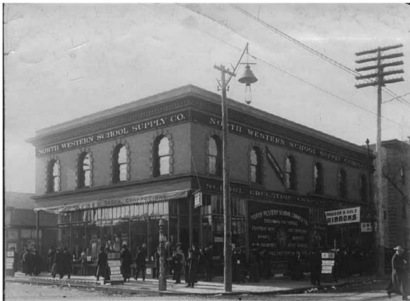
325-331 14th Ave SE, circa 1907.