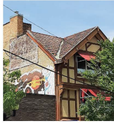
Look at the details on 321 14th Ave SE, built in 1910. The primary elevation has half-timbering and wood brackets under the eaves. The roof is covered with terracotta tiles. The side elevation has a ghost sign for a previous tenant and a colorful mural.