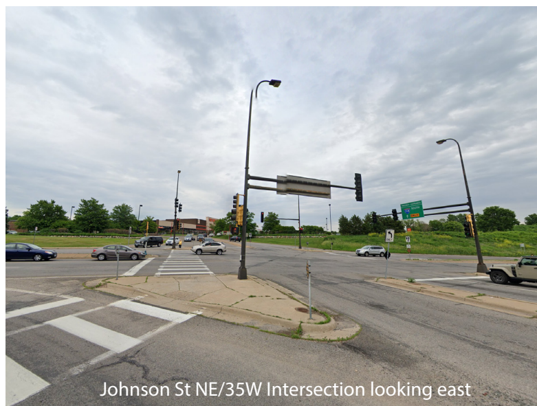
Johnson St NE/35W Intersection looking east