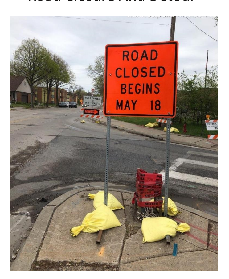
Road Closure And Detour