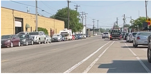
Xaaladda Iminka – Waqooyiga Wadada 2aad

Mashruuca waxaa lagu hirgelinayaa waddo labada dhinac u socota ee wadada bushkuleetiyada ee Wadada 2aad Waqooyi inta u dhaxeysa Wadada Dowling iyo Plymouth Waqooyi. Mashruuca waddo bushkuleetiga waxaa lagu bedelayaa wadada iminka jirta ee bushkuleetiyadu ay raacaan Waqooyiga Wadada 2aad ee khadka bushkuleetiyada kaasoo aan laheyn badbaado ku filan ee gaadiidka wadada la wadaagayo. Isgoysyada leh nalalka gaadiidka kala haga, waxa uu mashruucani ku darayaa naqshad dheeraad ah. Waxa uu mashruucu isku xirayaa waddo cusub oo labada dhinac u socota oo la kala saarayo dib u dhiska isgoysyada Wadooyinka Dowling iyo Wadada 2aad Waqooyi. Waxa kale oo uu isku xirayaa wadada lagu lugeeyo ee aan dhameystirneyn ee jardiinada Upper Harbor iyo mashruucyada wadada bushkuleetiyada ee jira.