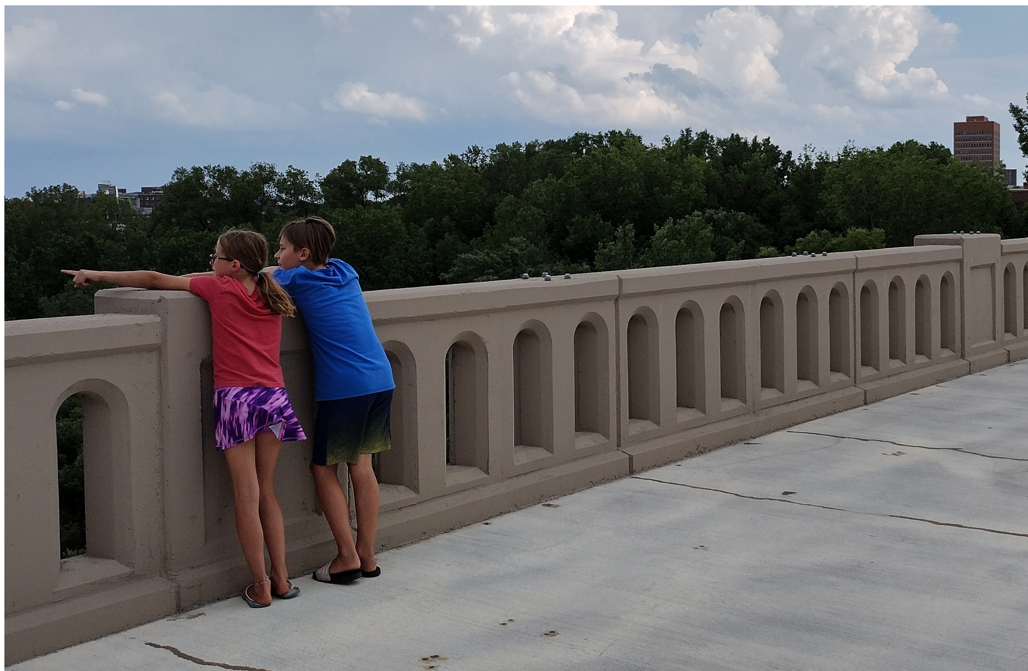
The proposed railing design (similar shown above on 10th Ave bridge) reflects the original design and is used on similar bridge rehabilitation projects in Minneapolis.