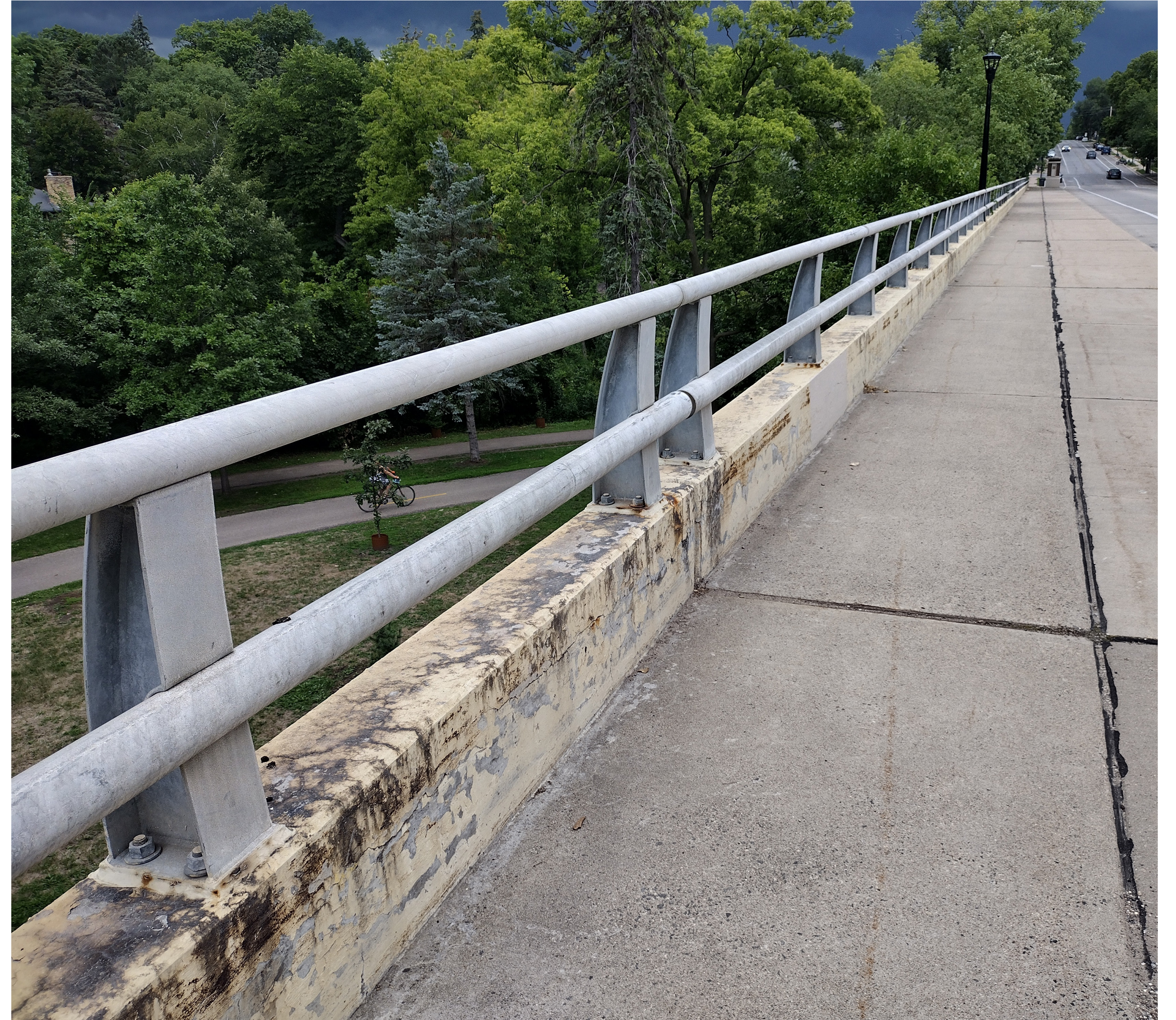
The original railings were replaced in the 1970's.