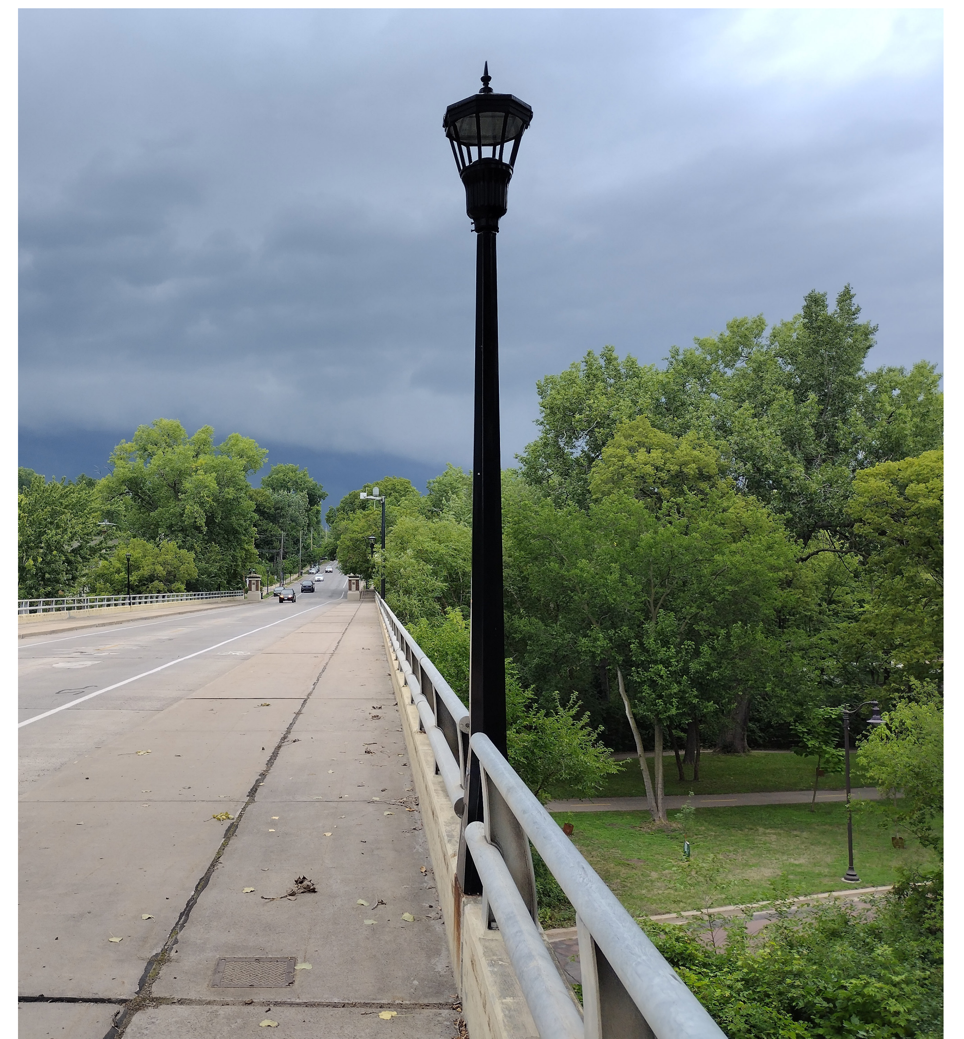
Lighting will be upgraded to energy efficient LEDs and maintain the existing "lantern" style.