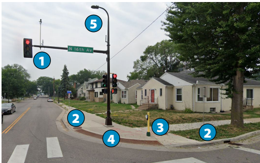
Example illustration, exact designs vary by location